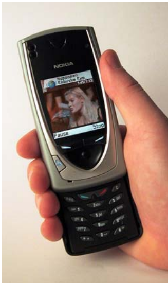
ILL. 1. Nokia 7650 mobile phone, RealOne Player and Hyppönen Enbuske Experience.

Besides being able to watch videos, the persons testing the use of videophone were entitled to make domestic telephone calls and send text and picture messages free of charge. Only international calls and calls to payable service numbers were not allowed. The availability of other mobile phone features was intended to make the use of the phone seem as natural as possible. In fact, the test period resembled the first-week use of a new phone.